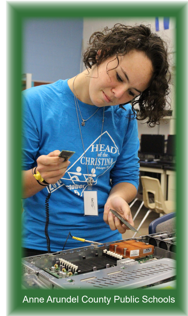
Anne Arundel County Public Schools