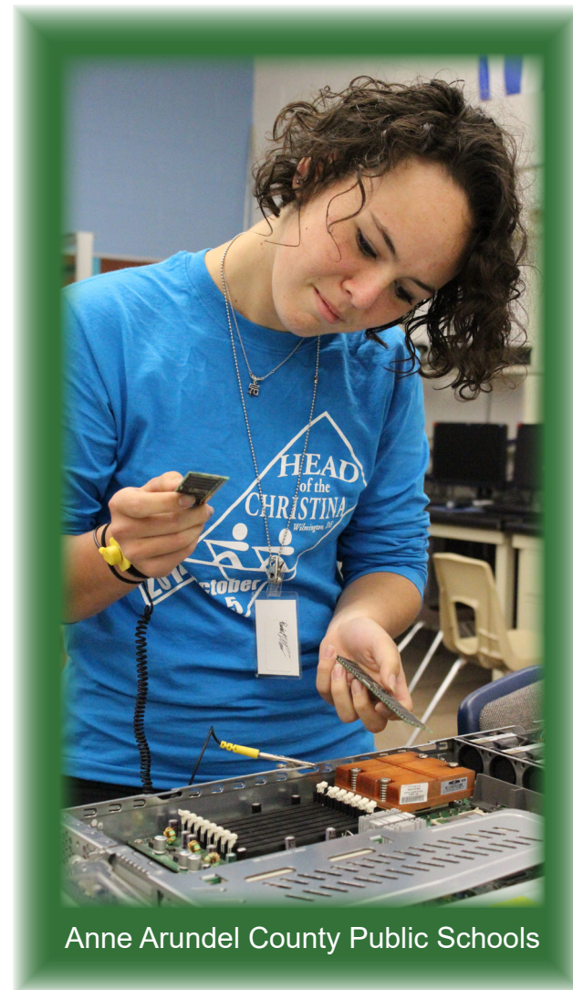
Anne Arundel County Public Schools